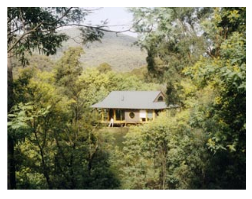
Adequate house protection in bushfire-prone areas can be provided by following the Australian Standard, AS3959.

This technical report explains which features of a house are least resistant to advancing fire, and why, and gives information on how to minimise the susceptibility of a house to bushfire attack.