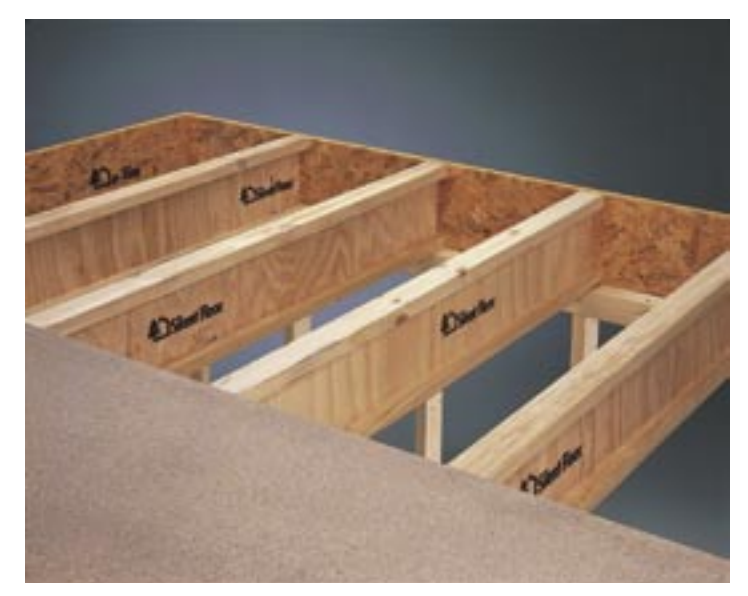
Research has shown that timber protected by standard lining materials, such as gyprock, will not be affected by fire until the temperature of the actual timber framing itself reaches 300°C.

For external and exposed applications, Australia has a range of high-density native hardwood timbers with considerable natural fire resistance. Seven timbers are sufficiently fire retarding to meet Australian Standard AS3959, and so can be used in bush-fire prone areas without any treatment. They are: