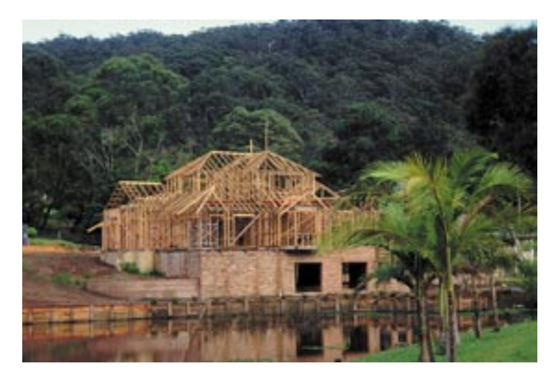
Research shows that the combustion of timber contributes relatively little to the total fire load when a timber-framed house burns.